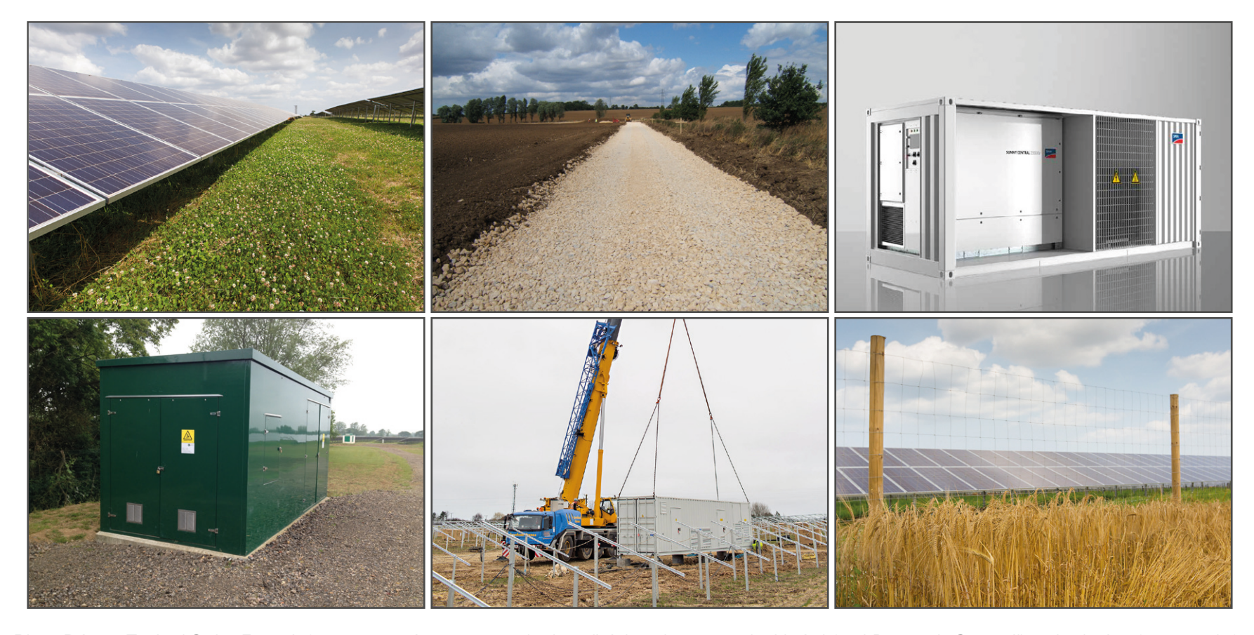
Plate DA.1 - Typical Solar Farm Infrastructure Appearance (colour finish to be agreed with Ashford Borough Council) - clockwise from top left: installed panels; typical site track; typical inverter/transformer unit; typical cabinet; construction works; typical site fencing and installed panels.