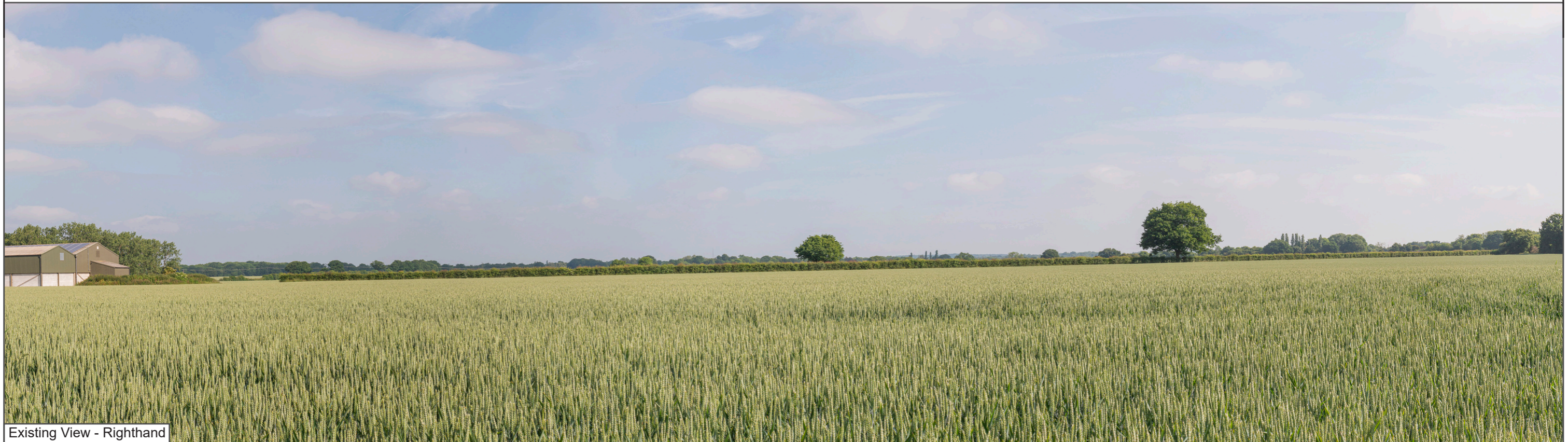
Existing View - Righthand