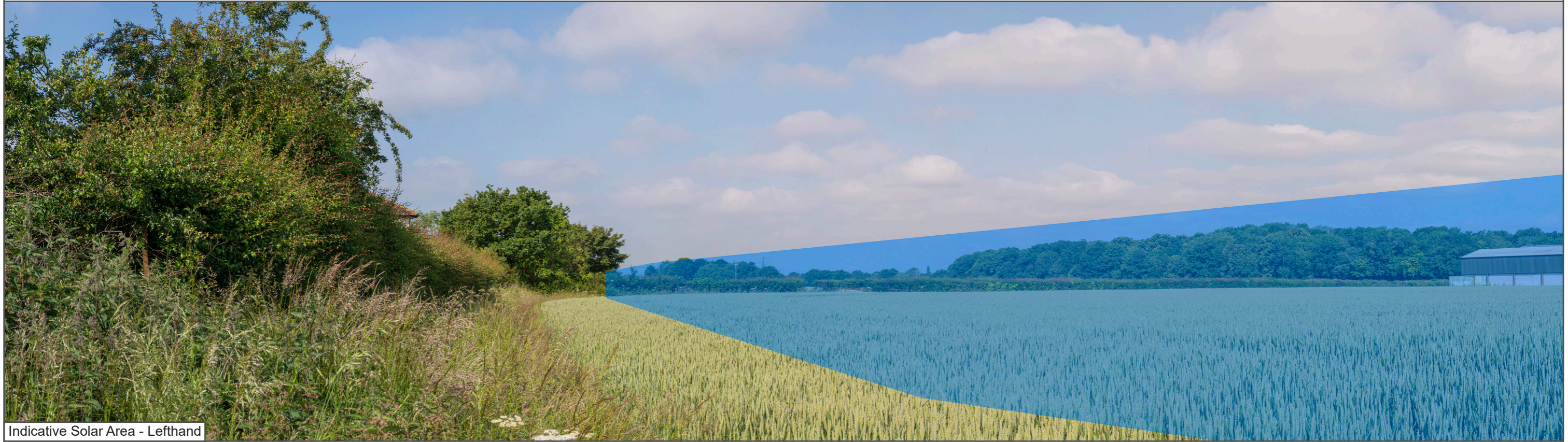
Indicative Solar Area - Lefthand