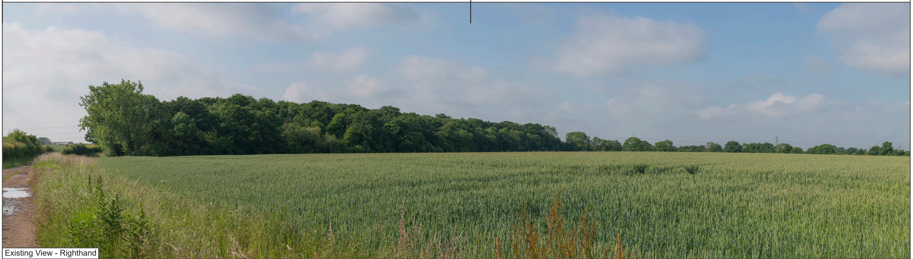
Existing View - Righthand