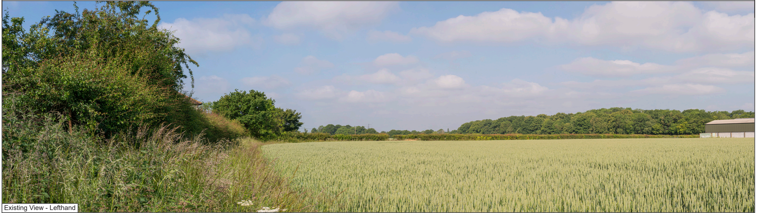
Existing View - Lefthand