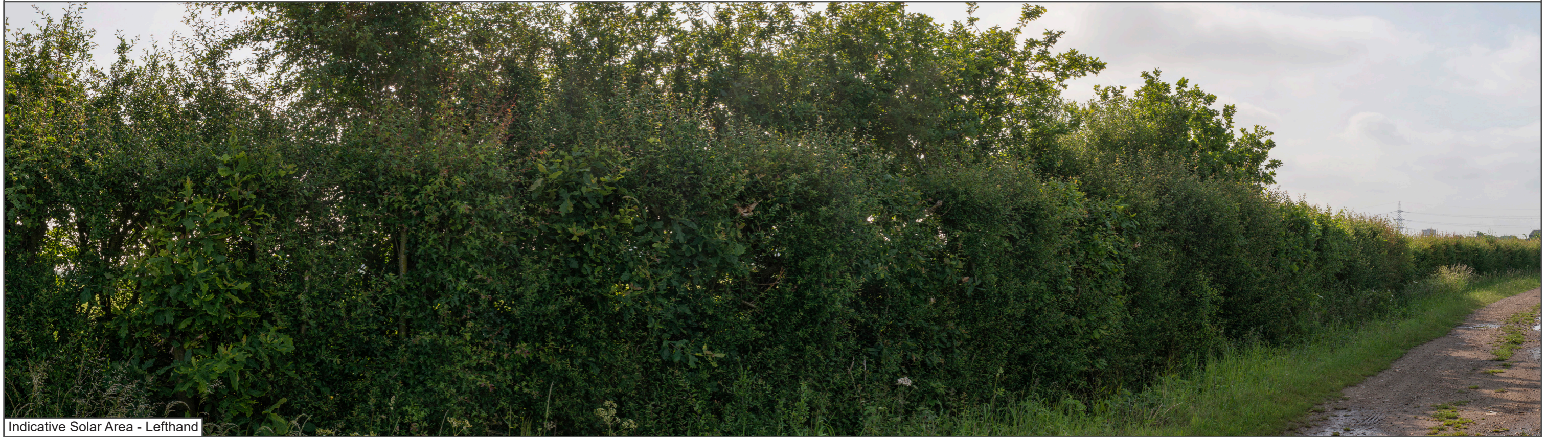
Indicative Solar Area - Lefthand