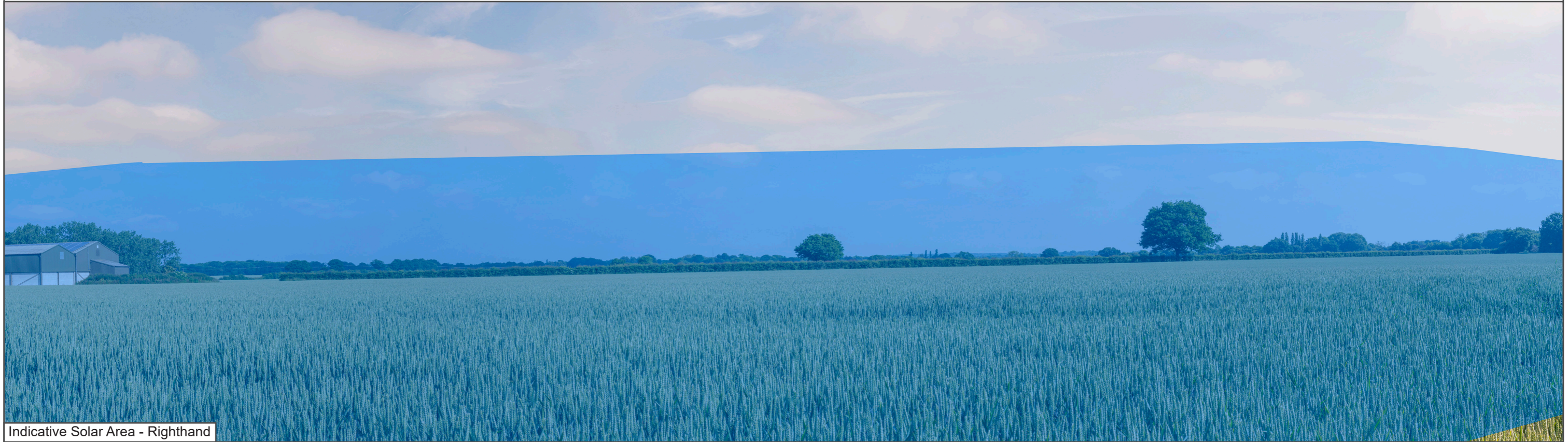
Indicative Solar Area - Righthand