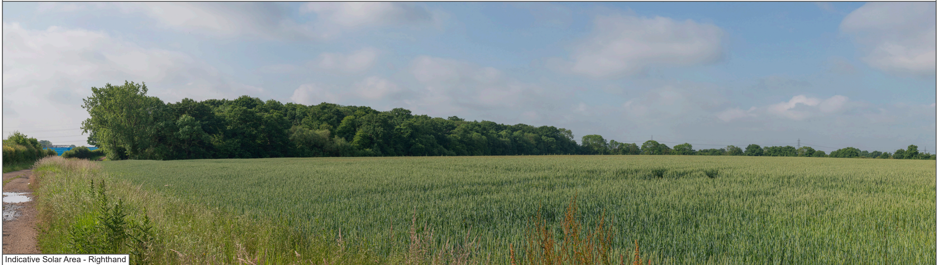
Indicative Solar Area - Righthand