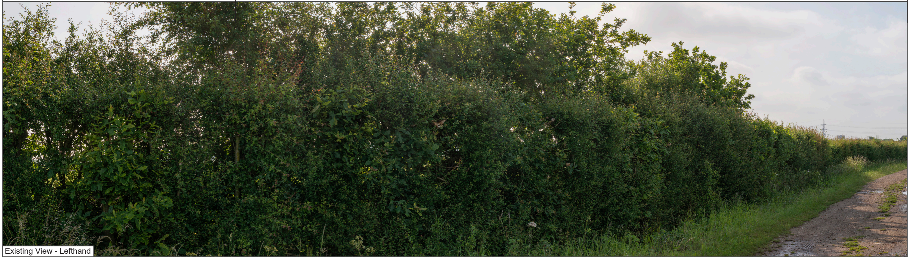
Existing View - Lefthand